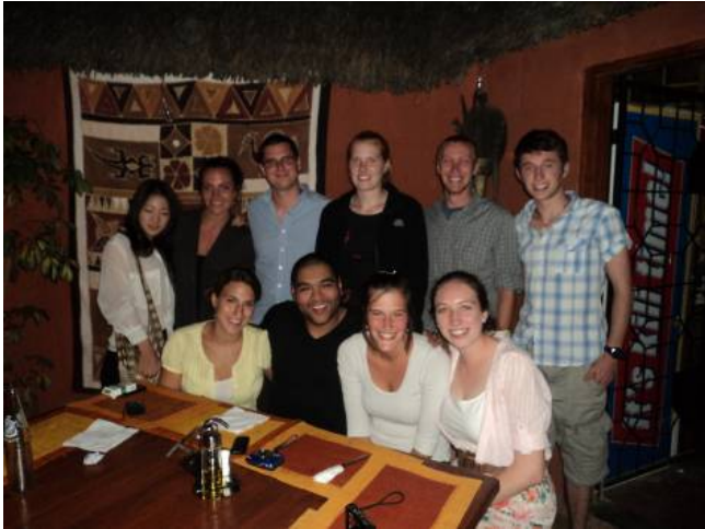
(Traditional Dance Ngoma event)